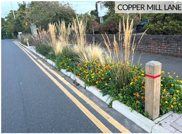
COPPER MILL LANE